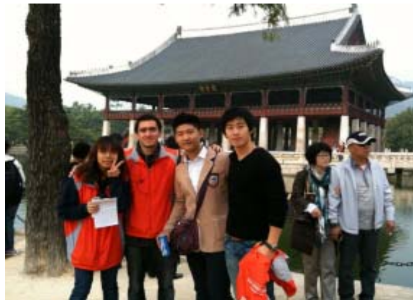
Student interns with YCC at Gyeongbokgung Palace