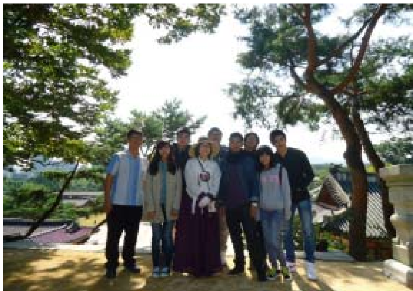
Student interns are receiving educating about Changgyeonggung Palace