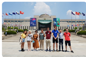
Korea War Memorial