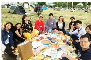
Han River Picnic